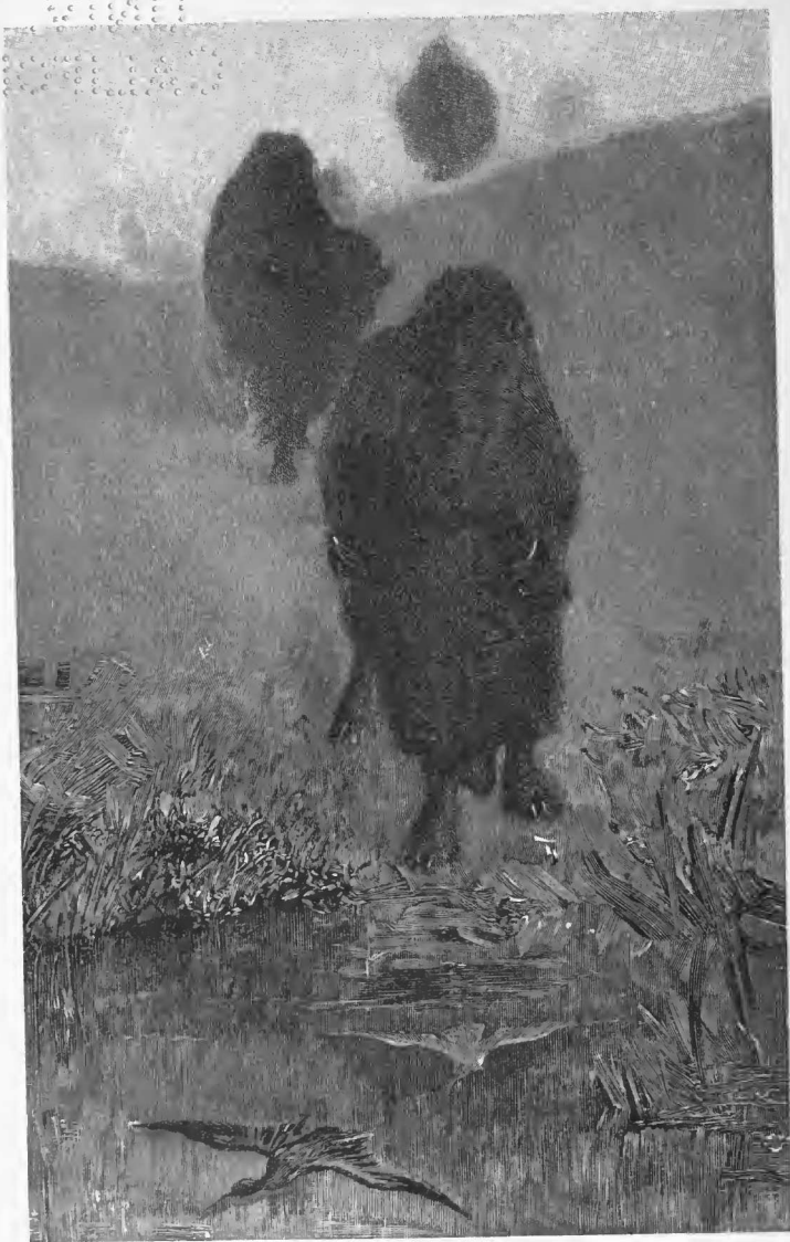
THROUGH THE MIST