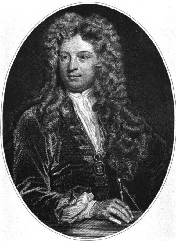
SIR JOHN VANBRUGH. From the Picture by Sir Godfrey Kneller.