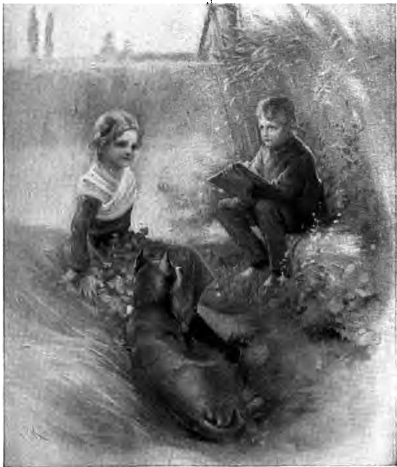
Nello drawing the likeness of Alois and Patrasche. See p. 145.