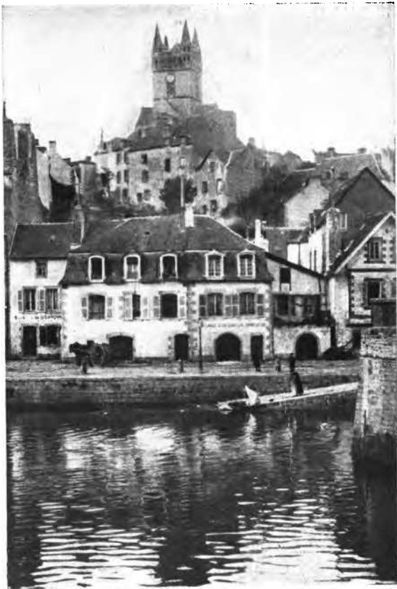
Quimperlé is prettily situated at the confluence of the tiny rivers Isole and Ellé