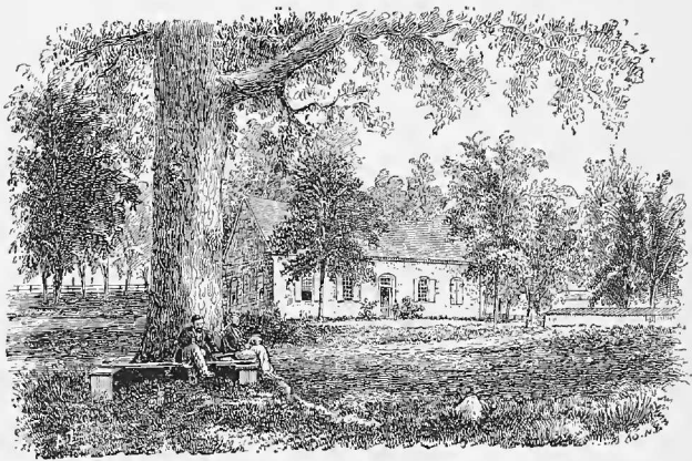
OLD PAXTANG CHURCH.