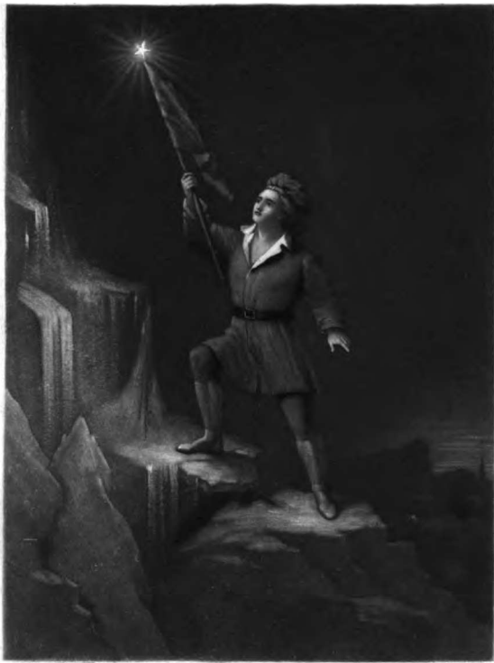
PAINTED BY T. B. READ