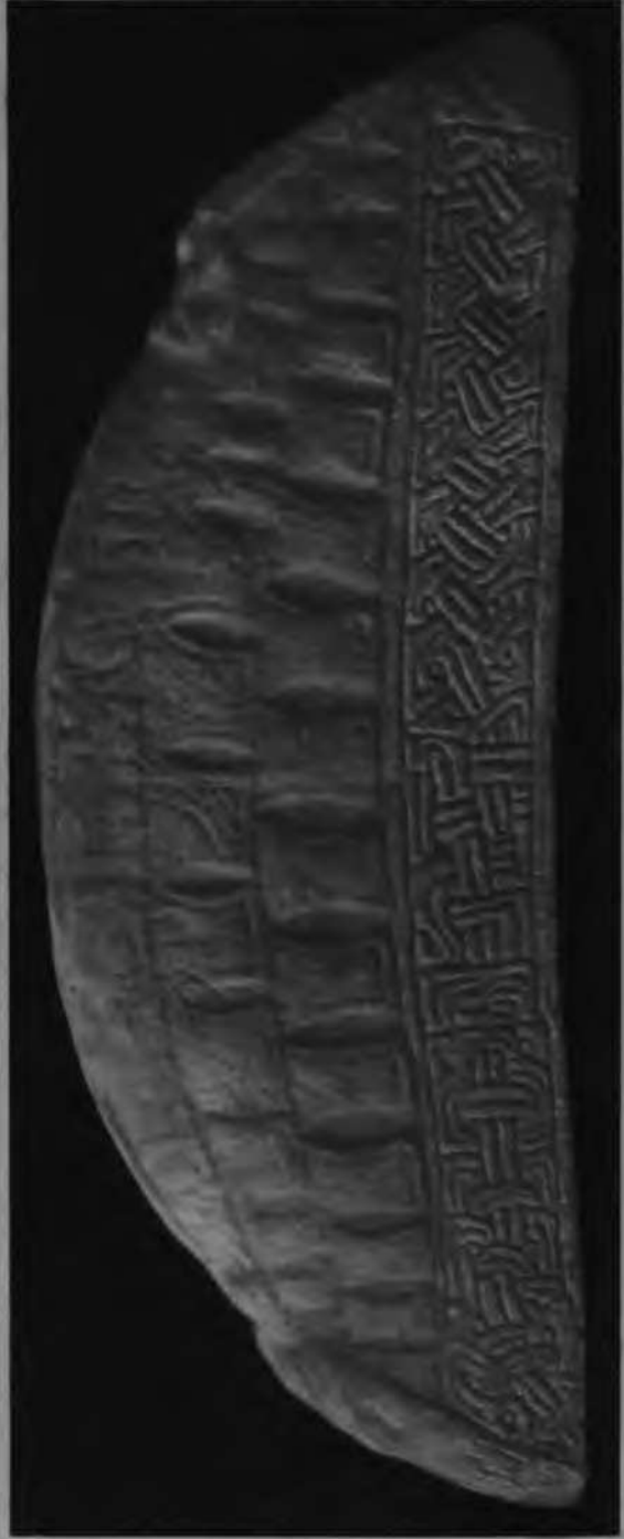
№ 2. 6.6 X .7 X 2.5 HIGH AT CENTRE.