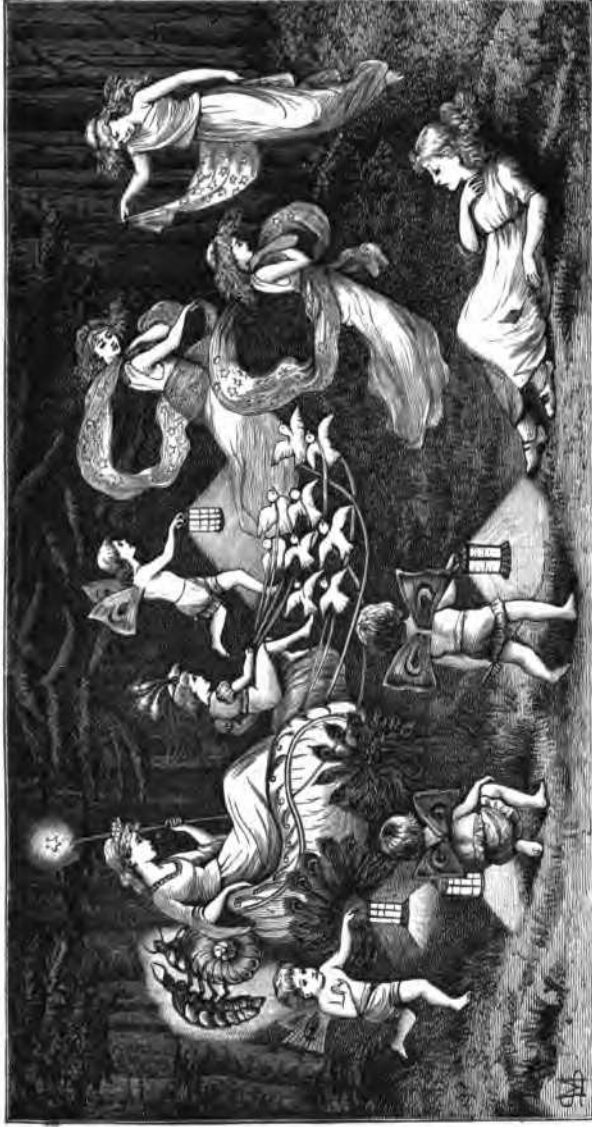
"THEN CAME THE QUEEN, RIDING ON A CAR OF CRYSTAL ORE, DRAWN BY A TEAM OF WHITE DOVES"—(See p. 50).