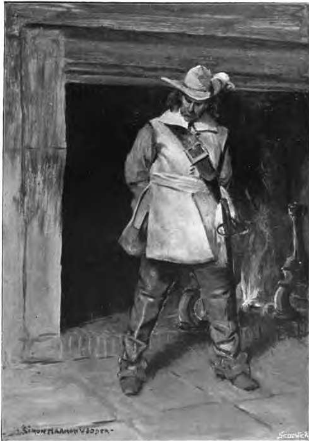
"THE CAPTAIN WAS STANDING WITH HIS BACK TO THE FIRE-PLACE"