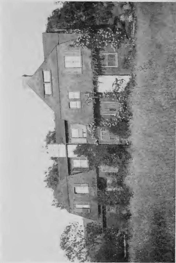
SHINGLED HOME ADORNED WITH VINES.