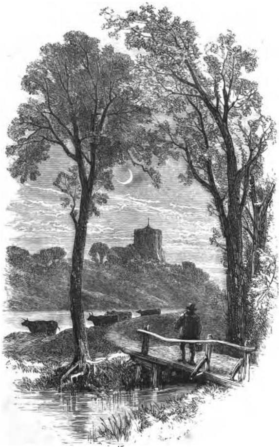
A JUNE NIGHT.