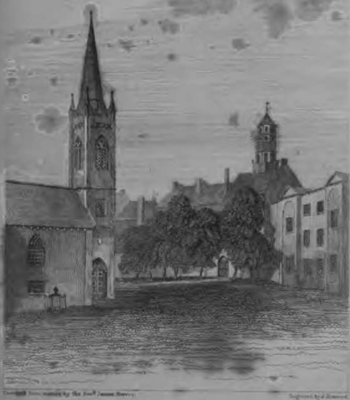
S T MARY'S CHURCH & POOR HOUSE (LEES LANE)