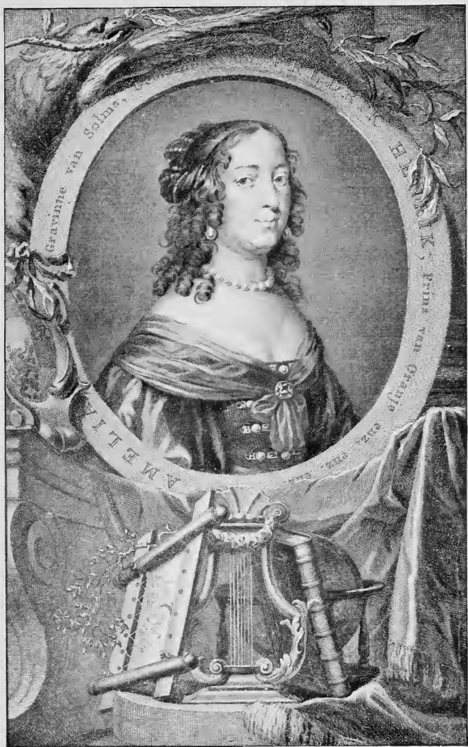
AMALIA VAN SOLMS (page 238)