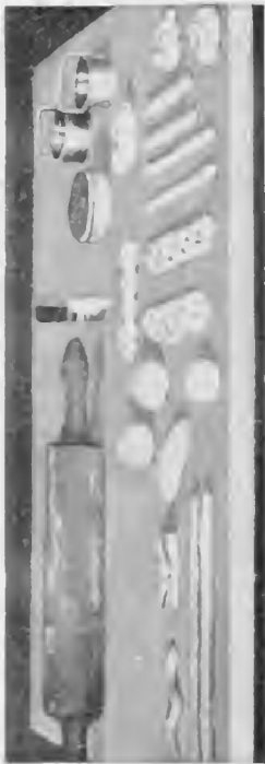
BRAIDSTICKS, BRAIDS AND FOCKEHBROOK POLIS—Page 79