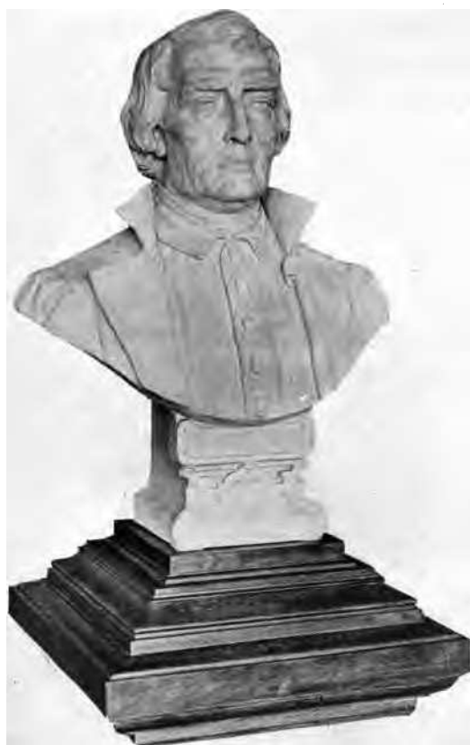
BUST OF OLAVUS PETRI. MODELED BY JEAN LE VEAU.