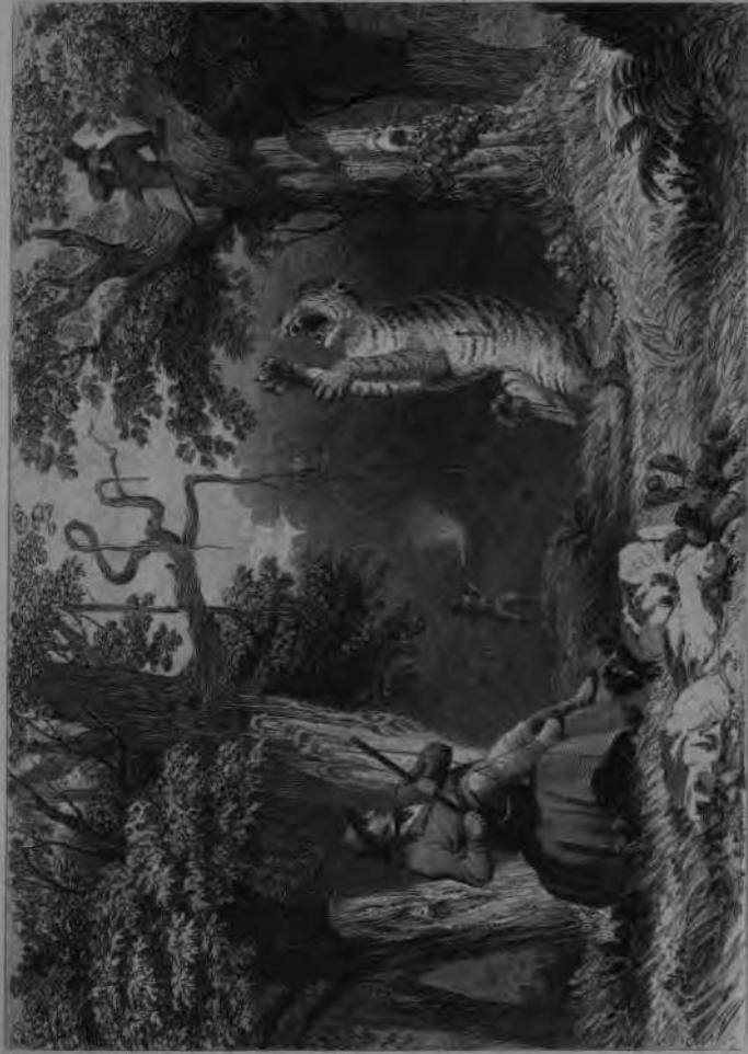
A TIGER SHOT JUST IN TIME.