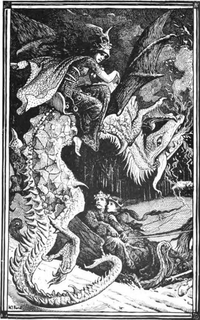
GORGONZOLA FLIES OFF ON HER DRAGON