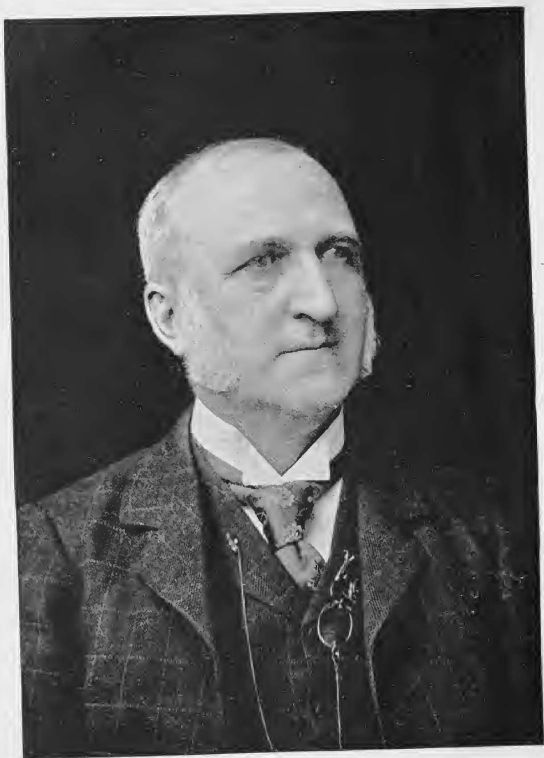
Chauncey M. Depew.