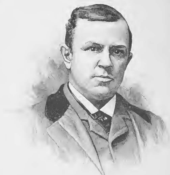
HENRY W. GRADY.