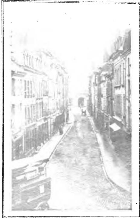
STREET IN SEDAN.