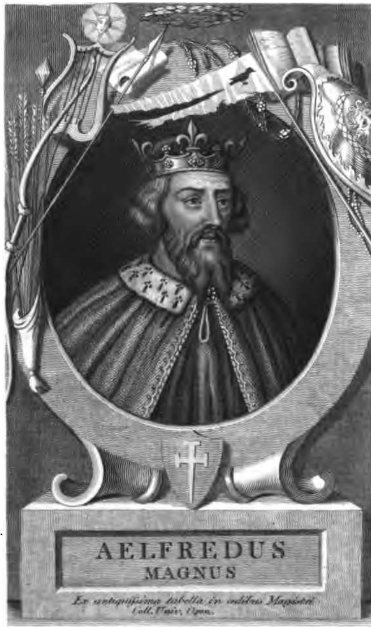
Engraved by M. Houghton, from a Print of Vertue's