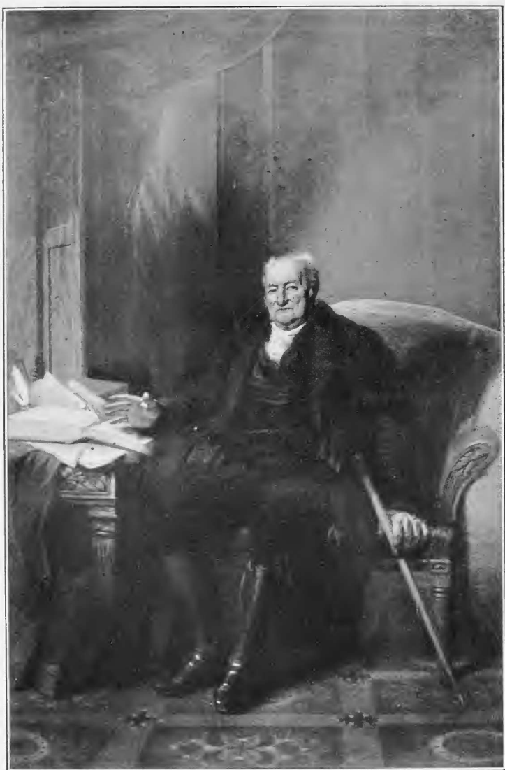
ELIAS BOUDINOT President of the American Bible Society, 1816