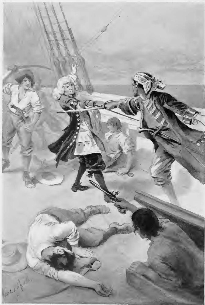
RUSHING BEHIND HIS EXCELLENCY, ONE OF THE RASCALS RAISED HIS CUTLASS.