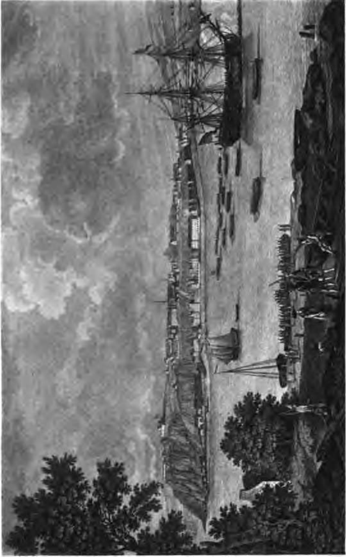
Harbor of San Francisco