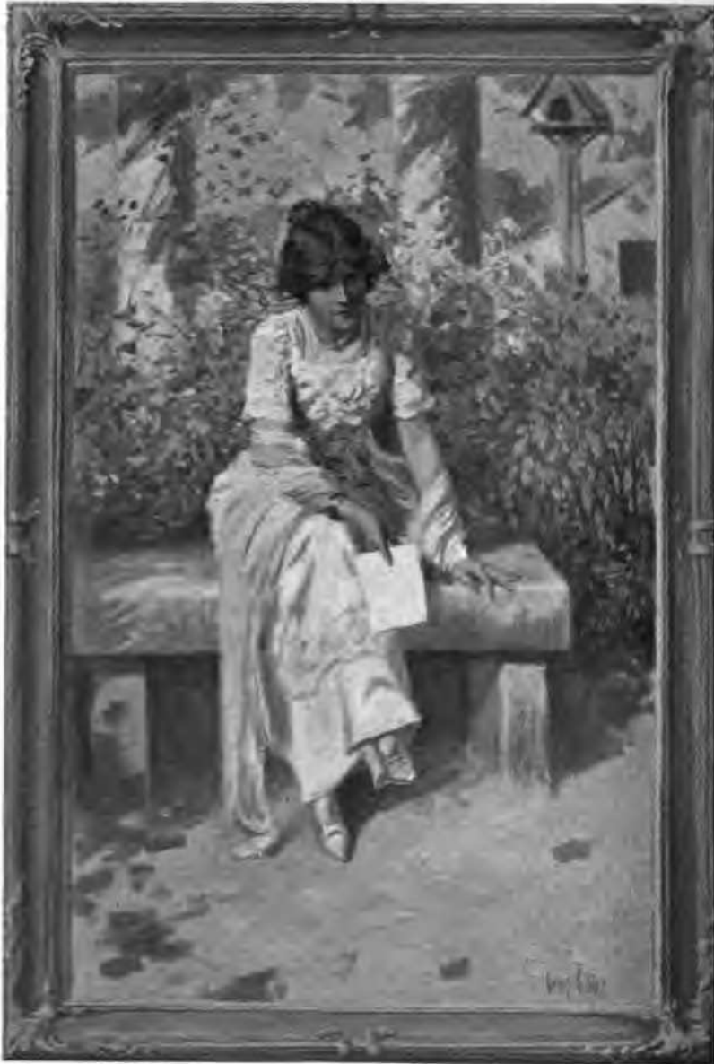
HER LIPS BARELY PARTED AS IF REPEATING THE WORDS SHE HAD JUST READ.