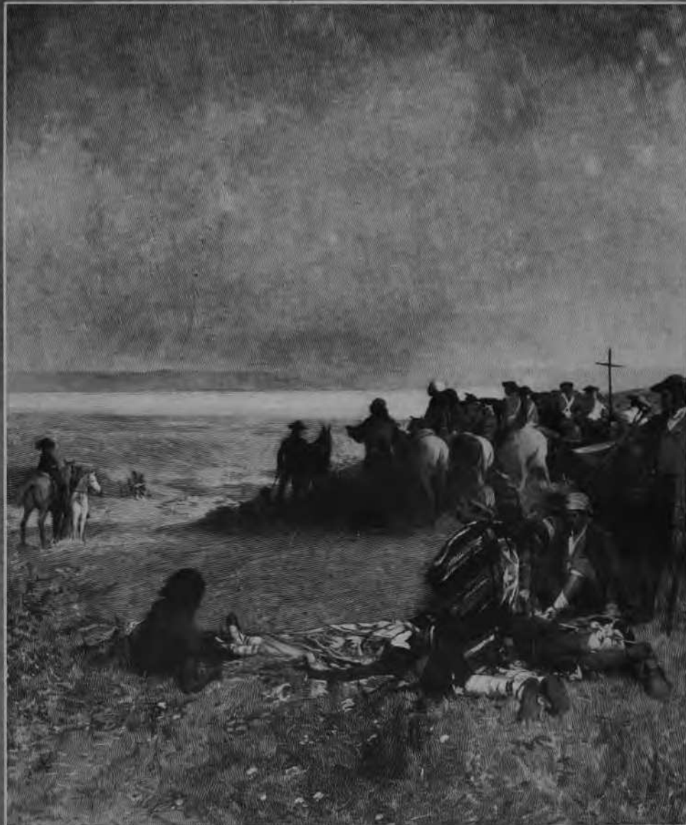
In 1768 Portola glimpsed the Bay of San Francisco. In 1774 Lieutenant Fages found for Padre Serra the entrance to the harbor, and at Point Lobos, above the Cliff House site, set up a cross of commemoration. On Christmas Eves, these latter years, more than a hundred thousand throng at Newspaper Corners, while Tetrzzini and Bispham sing or Kubelik plays. Less than seven score years link the pictures.